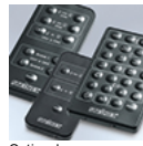
Optional remote controls