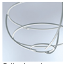
Optional guard cage